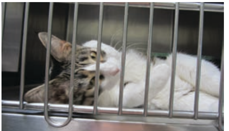
Feral cat tries to play with reporter's camera.